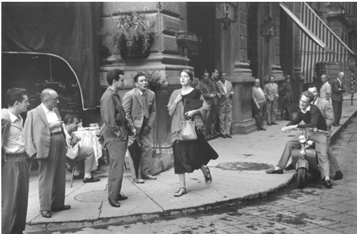
An American Girl in Italy, Florence, 1951