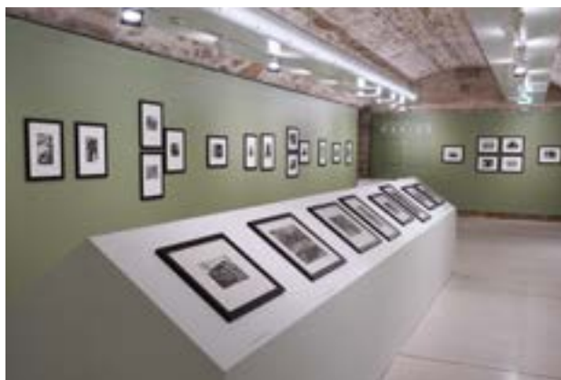
06 Exposition Henri Cartier-Bresson, Helen Levitt - Mexico Fondation HCB, 79 rue des Archives, février 2023