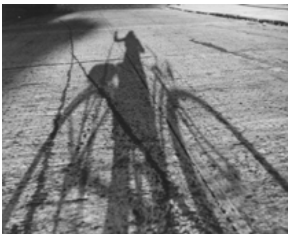
03 My shadow down the hill, San Francisco, 1938