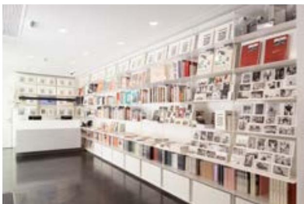
03 Accueil et librairie Fondation HCB, 79 rue des Archives, juin 2021