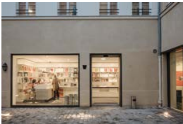
01 Fondation HCB, 79 rue des Archives, novembre 2018