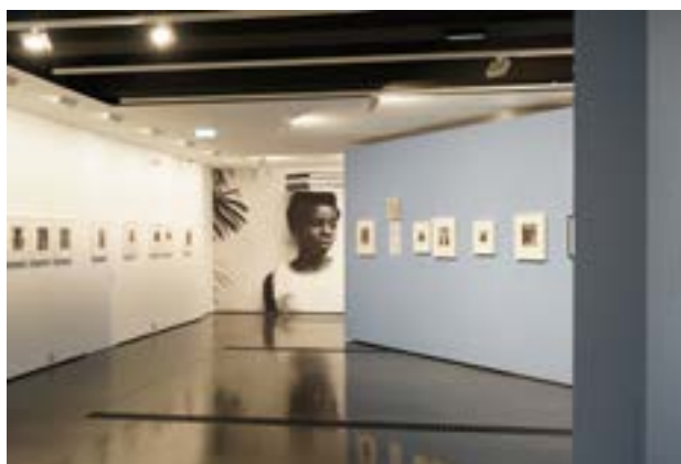
04 Exposition Paul Strand ou l'équilibre des forces Fondation HCB, 79 rue des Archives, février 2023