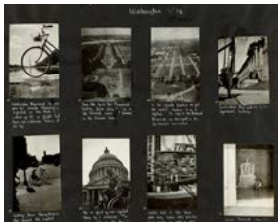
08 Washington, 1939