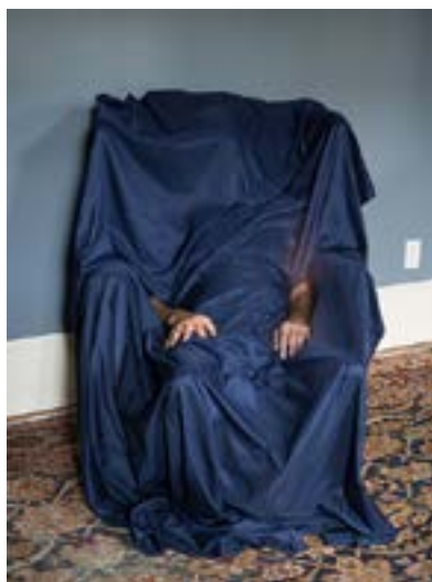
10 Blue Sheet with Hands (John D), 2022