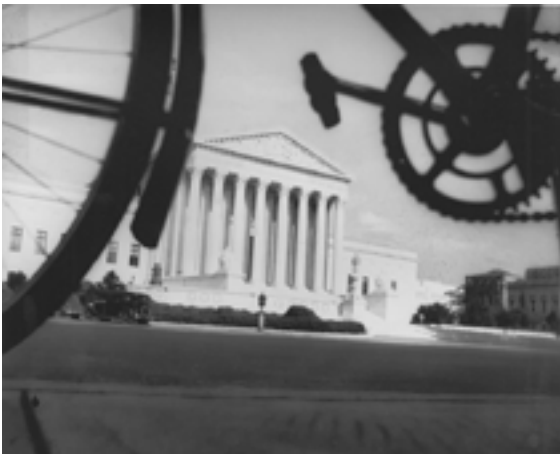
05 "Through the Wheels of Justice" The Supreme Court across from Capitol Hill, Washington D.C., 1939

All visuals must be used with their captions and copyrights. Only two images can be published.