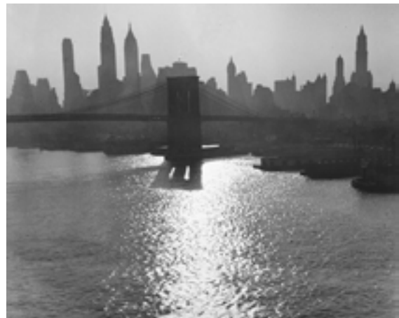
02 Sunset over lower Manhattan, New York, 1939