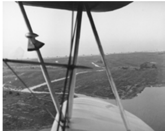
06 Conn & the Sound. Nearly lost my camera taking these because of wind, New England, 1939