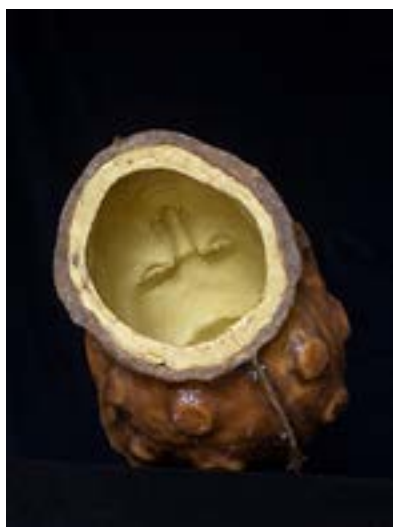
02 Man's Head, Inside, 2022