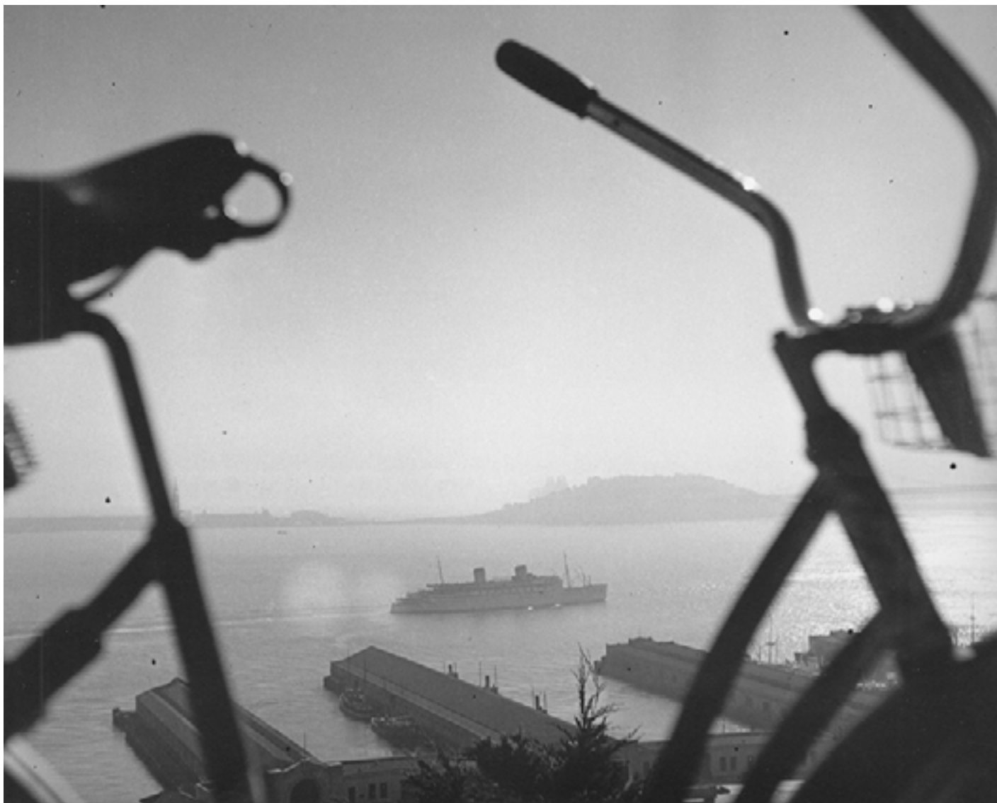
Bay from Coit Tower, Treasure Island at left, San Francisco, 1938