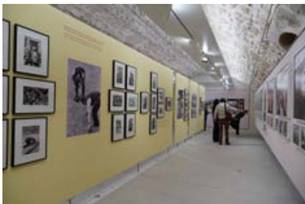
05 Exposition Henri Cartier-Bresson avec Martin Parr - Réconciliation Fondation HCB, 79 rue des Archives, novembre 2022