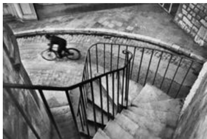
01 Henri Cartier-Bresson, Hyères, France, 1932