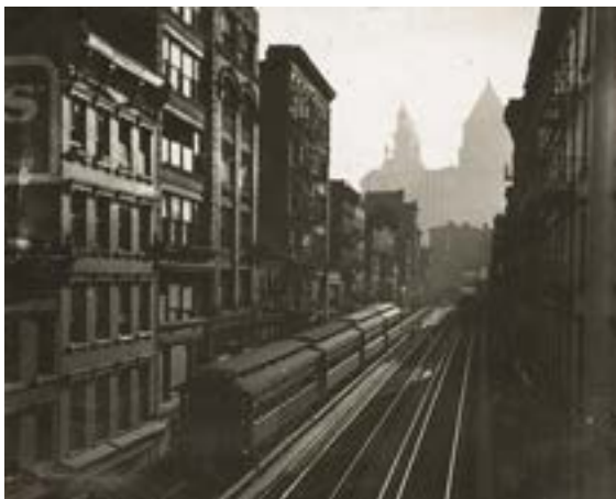
01 "El" running over a slum street. Municipal building in background, New York, 1939

All visuals must be used with their captions and copyrights. No image can be edited or cropped.