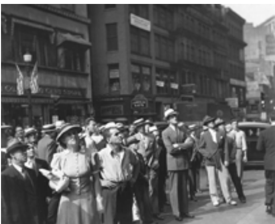
07 These people are standing in the middle of Washington St & reading the blackboard wall bulletins, on a newspaper office, Boston, 1939