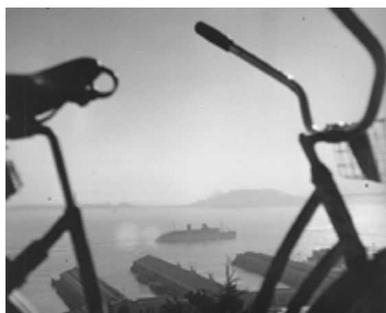
04 Bay from Coit Tower, Treasure Island at left, San Francisco, 1938