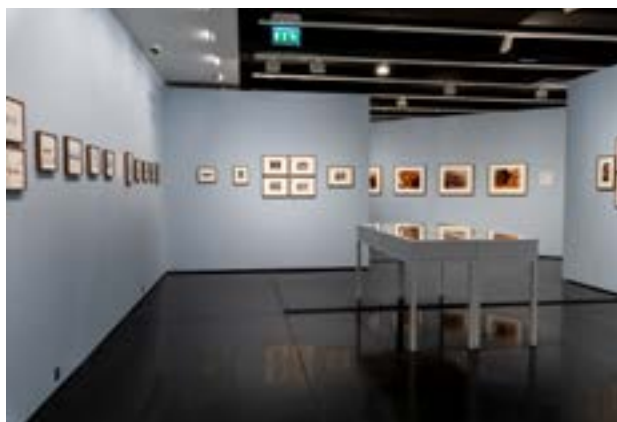
02 Exposition Jan Groover. Laboratoire des formes Fondation HCB, 79 rue des Archives, novembre 2022