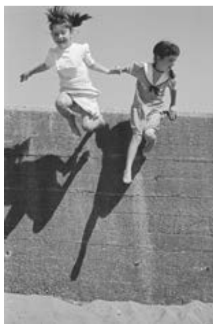
04 Martine Franck, Tory Island, Comté de Donegal, Irlande , 1995