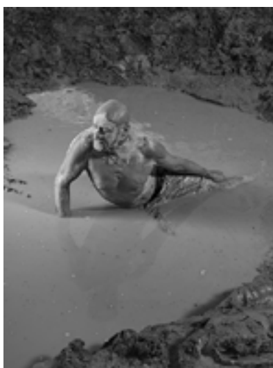
04 Reflection in Pond, after Cahun (John D), 2022