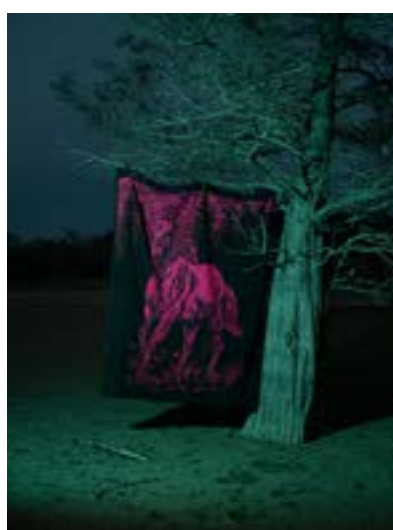
05 Stallion , 2022