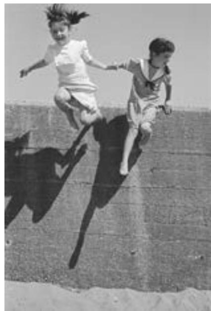
Martine Franck, Tory Island, Comté de Donegal, Irlande, 1995

Our team at Fondation Henri Cartier-Bresson is looking forward to celebrating this special event with photography fans!