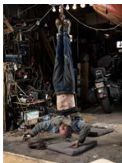
06 Centerfold (Wallace) , 2022