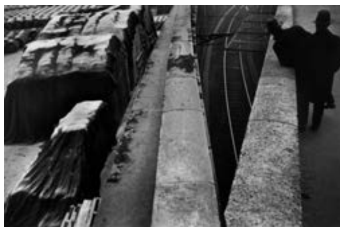
02 Henri Cartier-Bresson, Quai Saint-Bernard, Paris, France, 1932