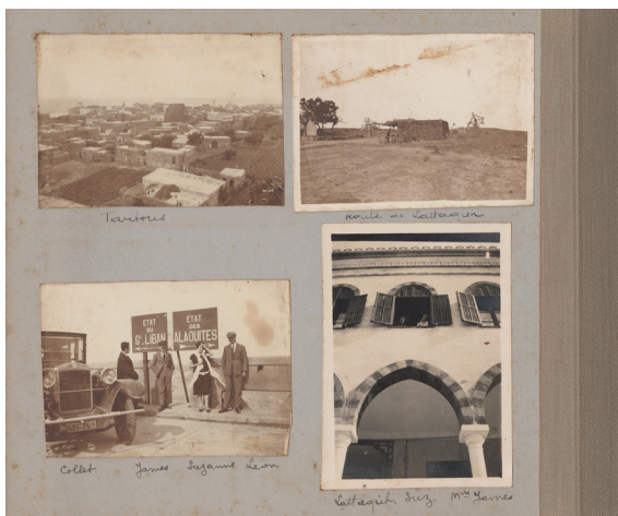
01 | René Pernot's album, Syria, 1926

All visuals must be used with their captions and copyrights. No cropping is permitted and only two images per medium can be published.