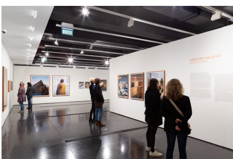
003 Fondation HCB, 79 rue des Archives, October 2020 Gregory Halpern exhibition