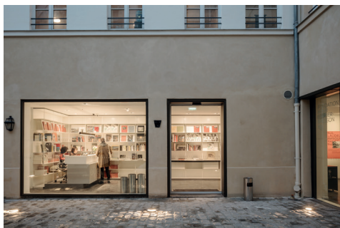
001 Fondation HCB, 79 rue des Archives, November 2018 Reception