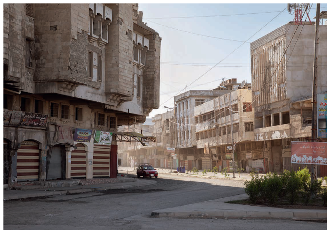
12 | Mathieu Pernot, Mosul, 2019