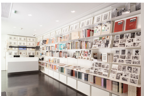
002 Fondation HCB, 79 rue des Archives, June 2021 Reception and bookshop