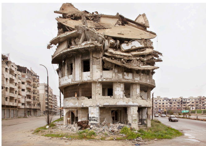
08 | Mathieu Pernot, Homs, 2020