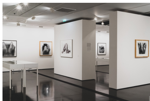
005 Fondation HCB, 79 rue des Archives, October 2021 John Coplans exhibition