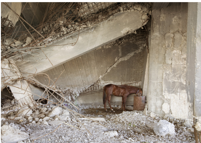
10 | Mathieu Pernot, Mosul, 2019