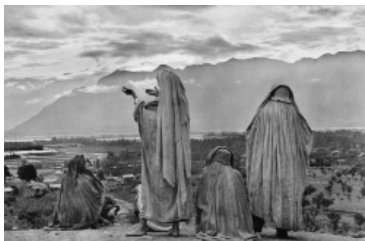
Srinagar, Inde, 1948