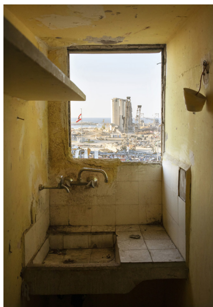
03 | Mathieu Pernot, Beirut, 2020