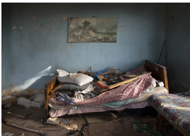
04 | Mathieu Pernot, Beirut, 2020