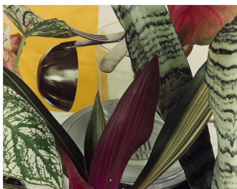
Jan Groover, Sans titre, ca.1978