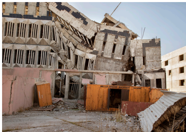
Mathieu Pernot, Mosul, 2019

ISBN : 978-2-36511-322-9 Only available in French.