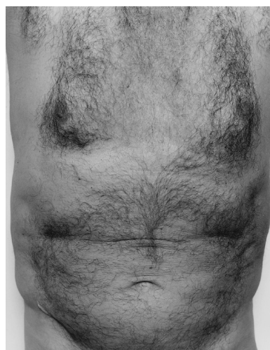
03 Torso Front , 1984