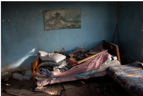
Beyrouth, 2020