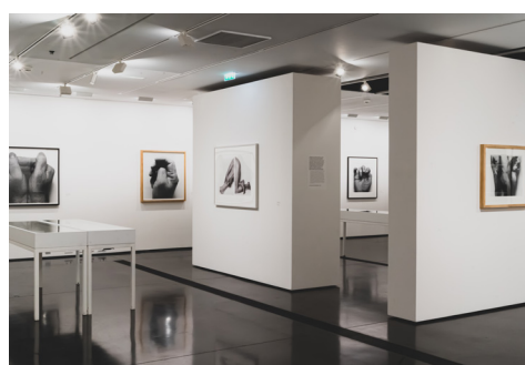
006 Fondation HCB, 79 rue des Archives, October 2021 John Coplans exhibition