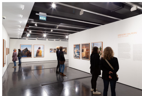
004 Fondation HCB, 79 rue des Archives, October 2020 Gregory Halpern exhibition