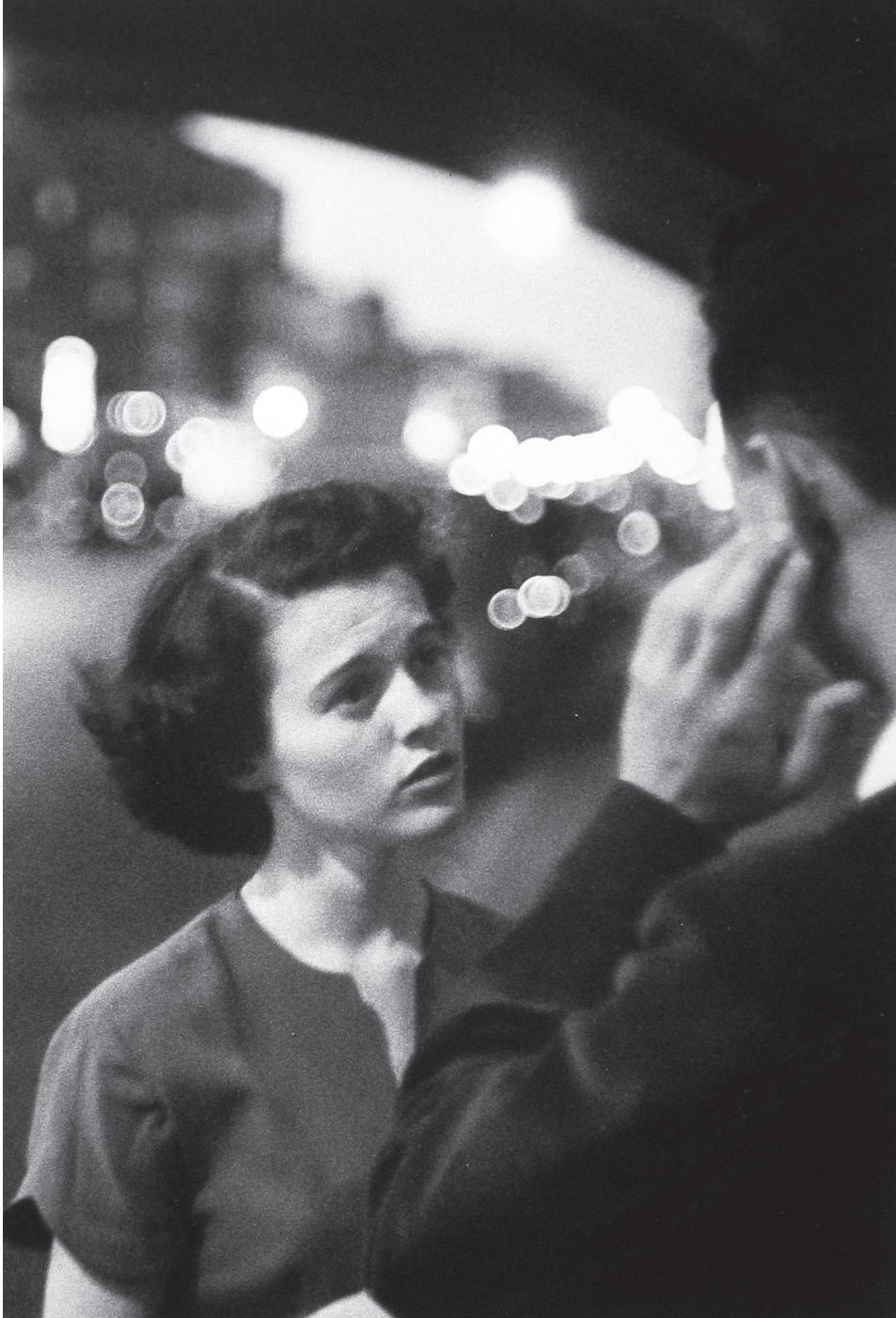
Louis Faurer, Deaf Mute , New York, 1950 © Louis Faurer Estate