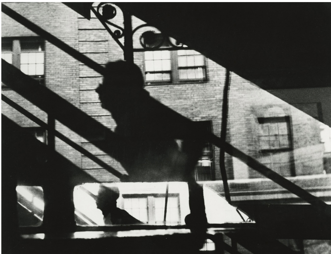
Louis Faurer, «Win, Place, and Show,» 3rd Avenue El at 53rd Street, New York, c.1946-1948

However, with shocking suddenness in 1976 I came to believe that American photography of the moment of mid-century belonged to Louis Faurer. Walter Hopps