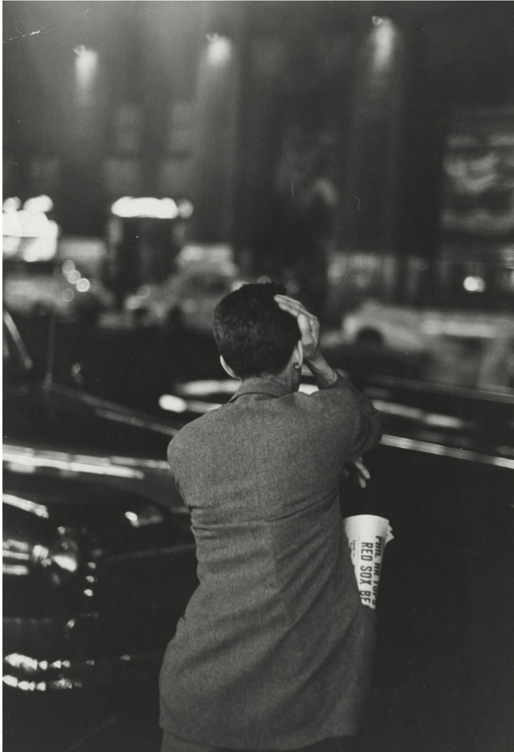
Louis Faurer, 42 nd Street, New York, c. 1948

"I have an intense desire to record life as I see it, as I feel it. As long as I'm amazed and astonished, as long as I feel that events, messages, expressions and movements are all shot through with the miraculous, I'll feel filled with the certainty I need to keep going. When that day comes, my doubts will vanish."