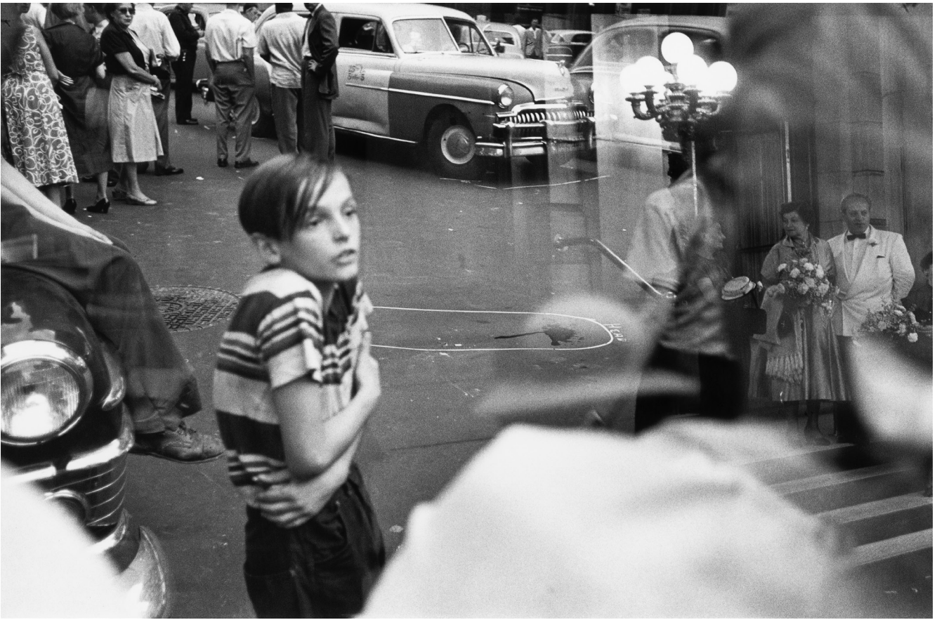
Accident, New York, 1952