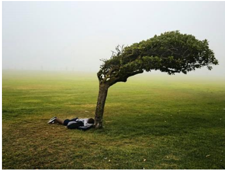
Green Point Common, Capetown, 2013