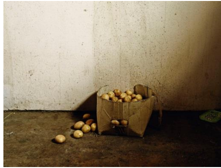
Inside the Bester's home, Vermaaklikheid, 2013