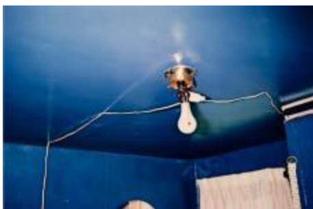
Sans titre, ca 1970

© William Eggleston / Eggleston artistic Trust, collection of the artist