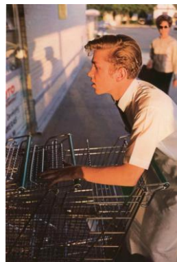
From Los Alamos Folio 1, Memphis, 1965 [supermarket boy with carts]