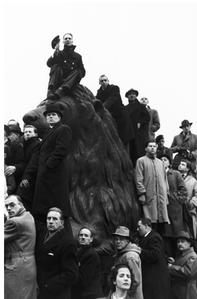
4 Henri Cartier-Bresson, Funeral of George VI, Trafalgar Square, London, England, 21 February 1952