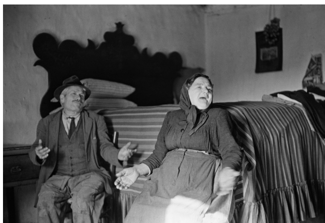
Henri Cartier-Bresson, Sanremo, Italy, 1953