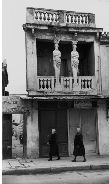
2 Henri Cartier-Bresson, Athens, Greece, 1953 © Fondation Henri Cartier-Bresson / Magnum Photos