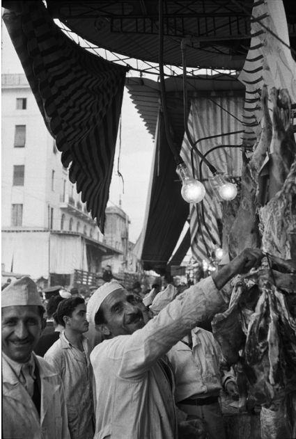
1 Henri Cartier-Bresson, Athens, Greece, 1953

Henri Cartier-Bresson's photographs must not, under any circumstances, be cropped or altered.