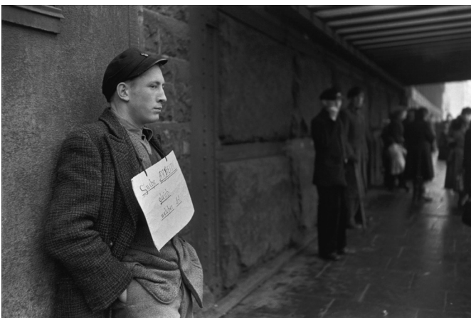
3 Henri Cartier-Bresson, West Germany, 1952