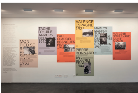
002 Fondation HCB, 79 rue des Archives, November 2018 Pearls from the Archives