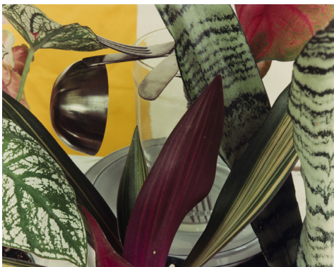
Jan Groover, Sans titre, ca.1978

In collaboration with the Musée de l'Élysée in Lausanne, the Fondation is presenting an exhibition dedicated to the American photographer Jan Groover (1943-2012) for the first time in France. Through her constant experimentation with the photographic medium, Jan Groover's work features an exceptional diversity of subjects, format and technical processes.