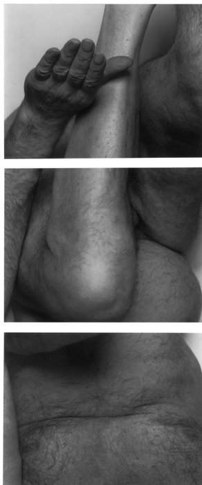
01 Upside Down No.1 , 1992

All visuals must be used with their captions and copyrights. No cropping is permitted.