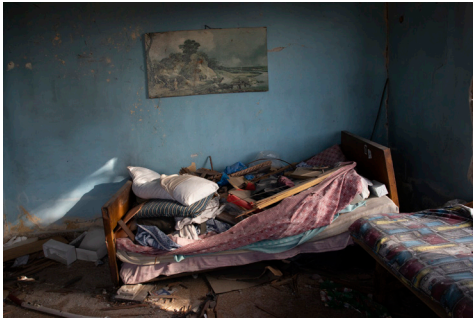
Beyrouth, 2020