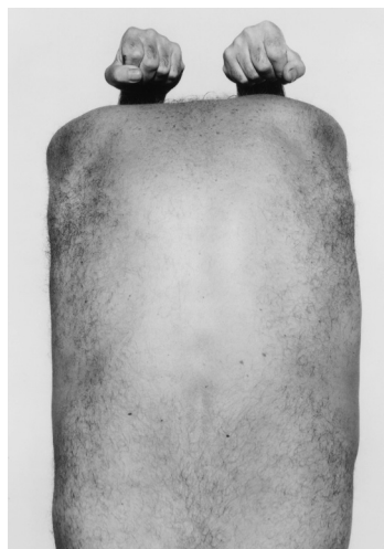
07 Back with Arms Above, 1984