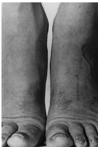
06 Feet, Frontal, 1984