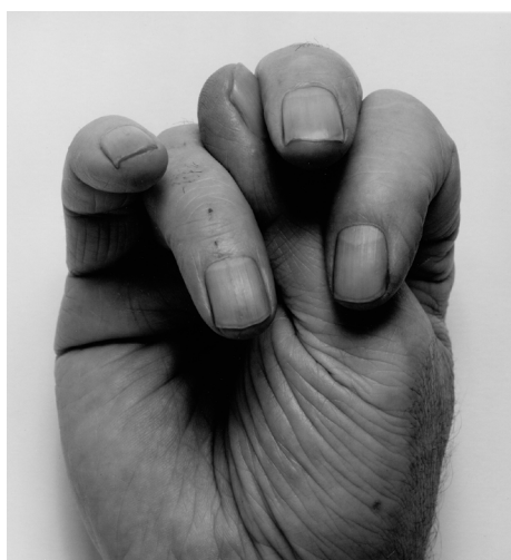
02 Front Hand, Thumb Up, Middle , 1988