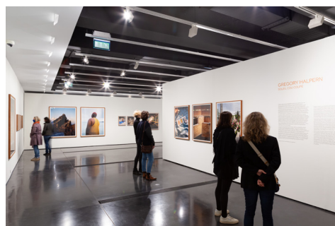
005 Fondation HCB, 79 rue des Archives, October 2020 Gregory Halpern exhibition