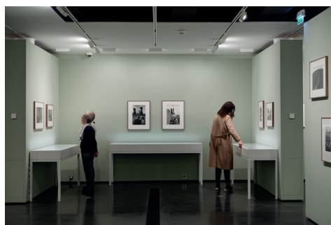
004 Fondation HCB, 79 rue des Archives, November 2018 Martine Franck exhibition