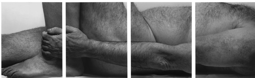
05 Lying Figure, Holding Leg, Four Panels, 1990 © The John Coplans Trust

All visuals must be used with their captions and copyrights. No cropping is permitted.