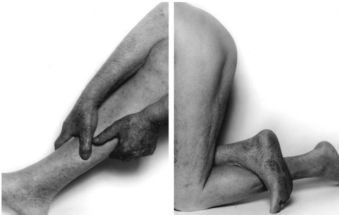
Body Parts, No. 8, 2001

Coplans, who emigrated to the United States at the start of the 1960s, was at first painter, art critic, museum director and curator before devoting himself fully to photography in the early 1980s. At sixty years old, after twenty years of promoting the work of other artists, he retired to take up a life in art. He then developed a photography practice in which he represented himself nude, in black and white and often fragmented, his head always out of frame. To all these images, produced between 1984 and 2002, he attributed the generic title Self Portrait ; descriptive titles and subtitles specify the body part depicted or the posture.