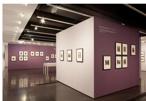
006 Fondation HCB, 79 rue des Archives, June 2021 Eugène Atget exhibition