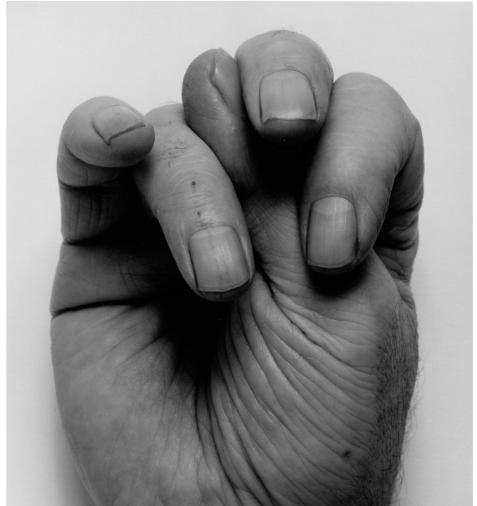
Front Hand, Thumb Up, Middle, 1988

In 1980, he decided to cease these activities to become an artist again and to devote himself to photography. He moved to New York. From 1985 onwards, he exhibited regularly in France and Europe. In 1988, the San Francisco Museum of Modern Art (SFMOMA) set up the first major exhibition of the photographer, which was then presented at the MoMA in New York the same year. John Coplans died in New York on August 21, 2003.