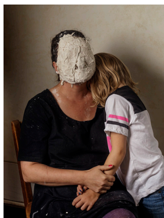
002 From the project Knit Club , 2020