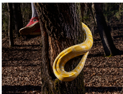
007 From the project Knit Club , 2020