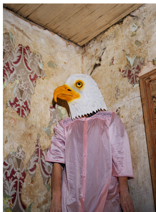
005 From the project Knit Club , 2020