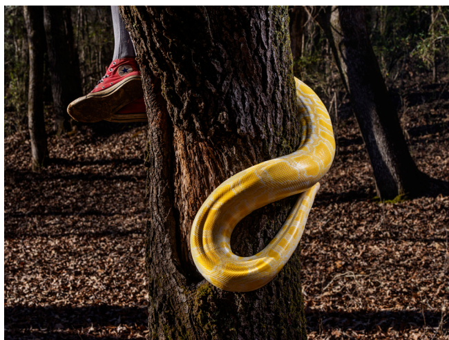
From the project Knit Club , 2020