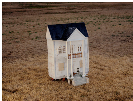
004 From the project Knit Club , 2020