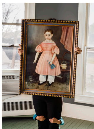
006 From the project Knit Club , 2020