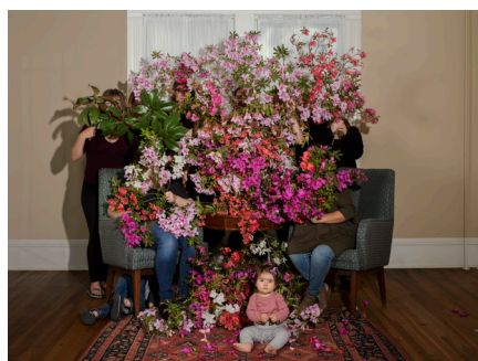
003 From the project Knit Club , 2020