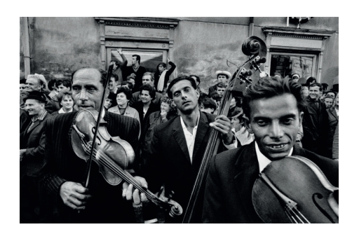
JOSEF KOUDELKA 1991