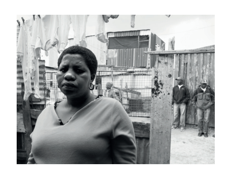
DAVID GOLDBLATT 2009