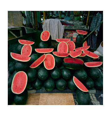
PATRICK FAIGENBAUM 2013