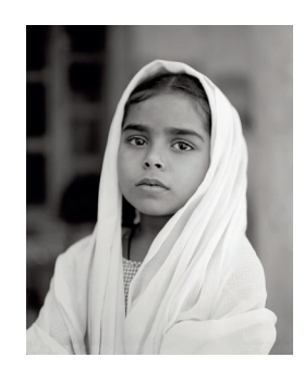
FAZAL SHEIKH 2005