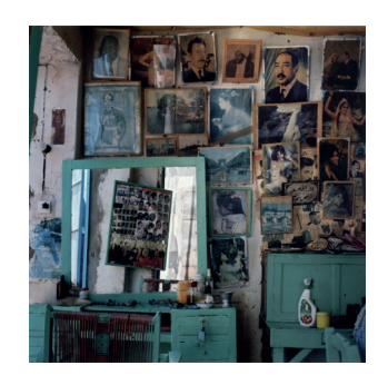
CLAUDE IVERNÉ 2015