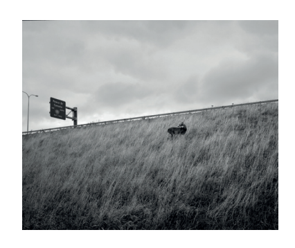
VANESSA WINSHIP 2011