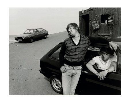
CHRIS KILLIP 1989