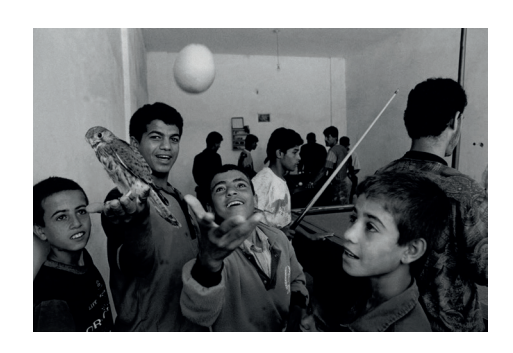
LARRY TOWELL 2003