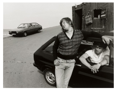
CHRIS KILLIP 1989

The HCB Award has been granted to nine photographs: